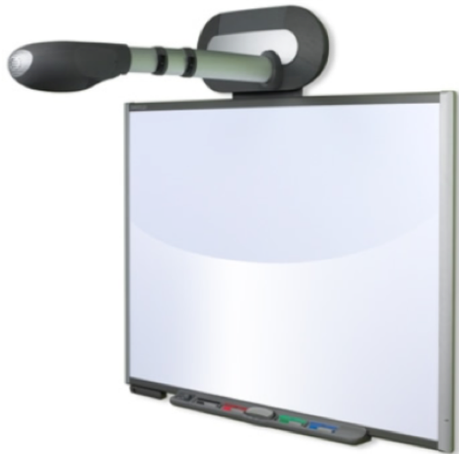
an interactive whiteboard

Optional: Show students their progress during class!